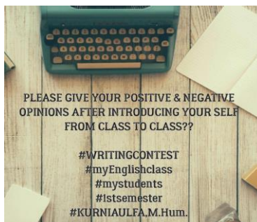
Figure 2. Picture of Instruction Writing Contest

The data was taken from the first semester students who followed the “Writing contest on Instagram” based on their practice by introducing their self in English to their senior class, the students will be wrote their comments in positive and negative sentences on Instagram, from this comments the writer will be taken the sixth highest scores to measure the ability of writing skill. The picture belows has been shown on Instagram as the instruction of the students format to follow the writing contest: