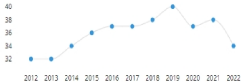
Figure 3. Corruption Perception Index in Aceh Province from 2012-2022

The available data provides a very clear picture of the corruption situation in Aceh Province. This data covers various stages of handling corruption cases, such as investigation, investigation, prosecution, inkras decision, and execution. From this data, you can conclude that criminal acts of corruption in Aceh Province have increased every year. This indicates that corruption is still a serious problem that needs to be dealt with firmly.